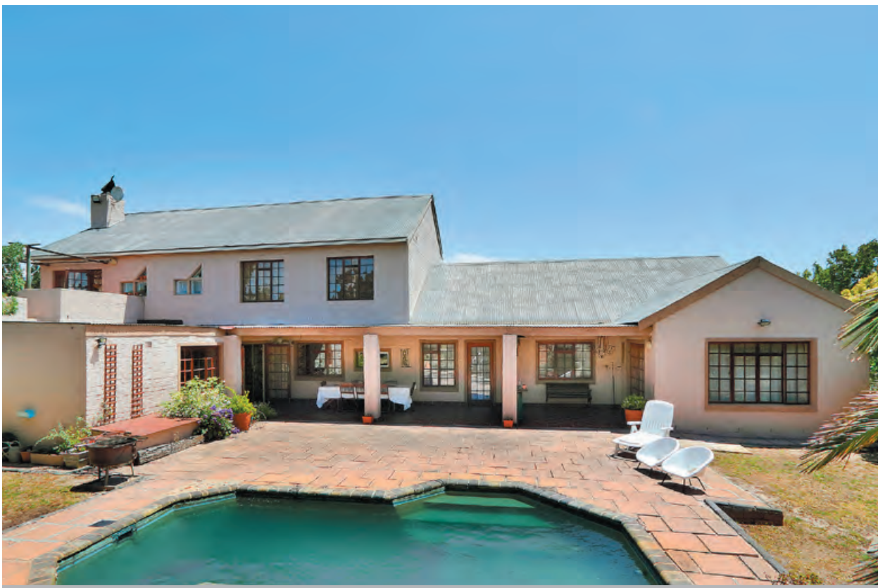
VIERLANDEN R6 330 000