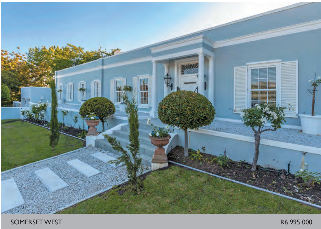
SOMERSET WEST R6 995 000