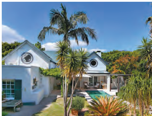
FRANSCHHOEK R8 950 000