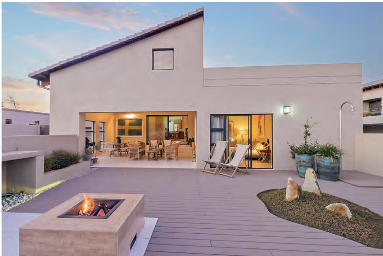
SANDTON R4 999 000