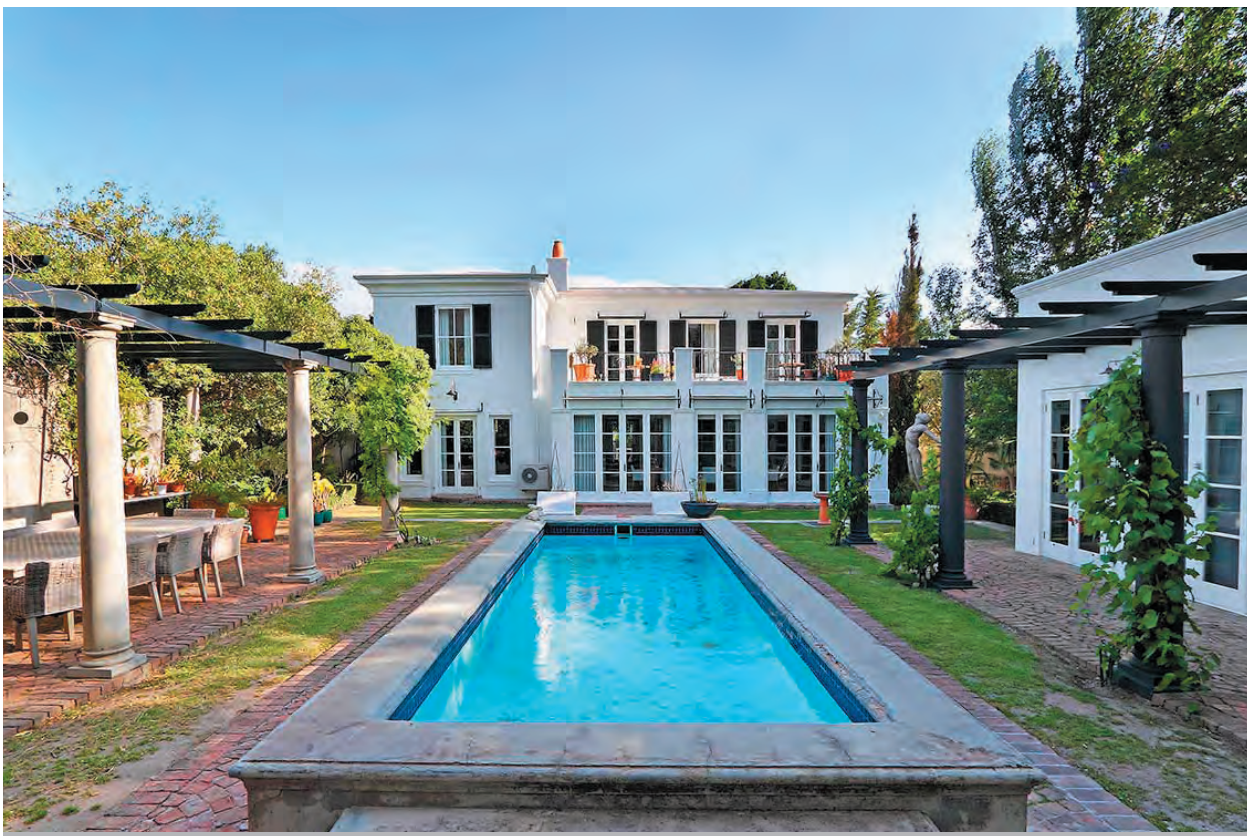
FRANSCHHOEK R12 950 000