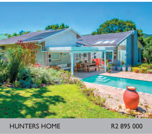
HUNTERS HOME R2 895 000

Local expertise, national presence and international audience