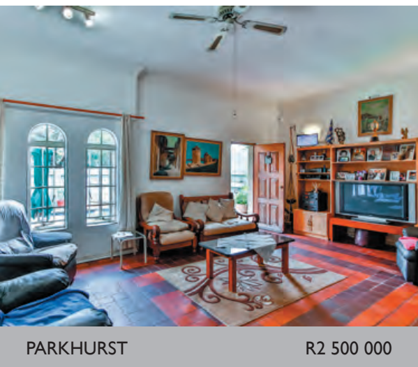
PARKHURST R2 500 000