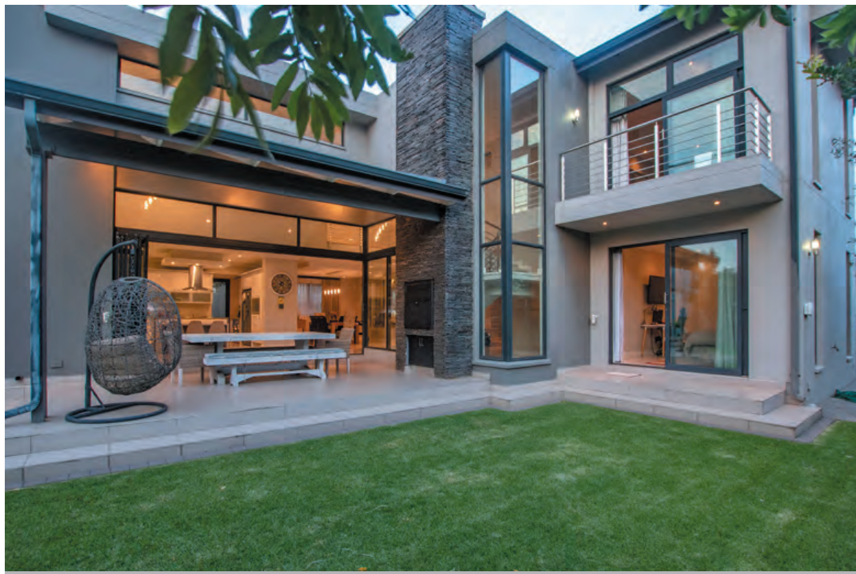
WATERFALL COUNTRY VILLAGE R5 990 000