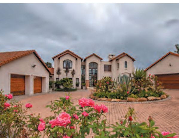
SADDLEBROOK ESTATE R6 900 000