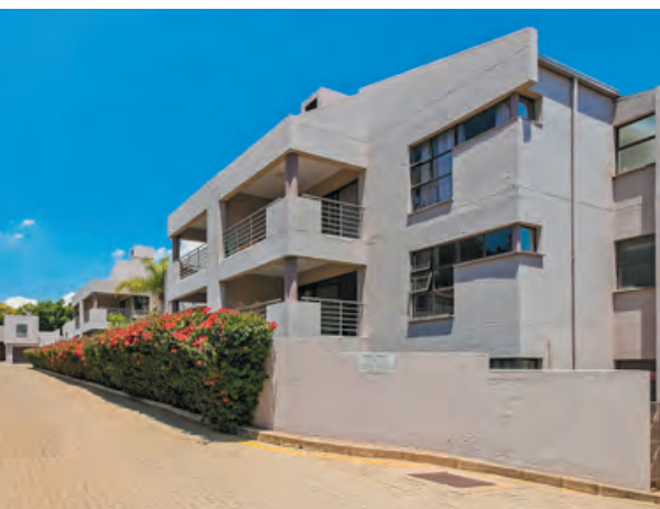
HYDE PARK R2 100 000