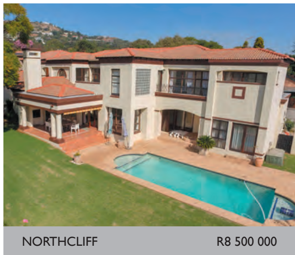
NORTHCLIFF R8 500 000