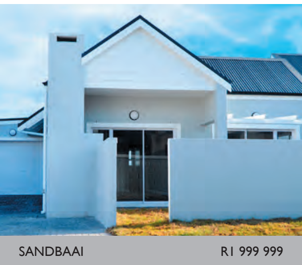
SANDBAAI R1 999 999