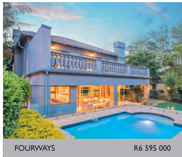
FOURWAYS R6 595 000

Fit for a king and a queen this magnificent home feels like one is floating in a dream. High ceilings, contrasting textures and quality finishes exude warmth and a majestic yet modern feel.