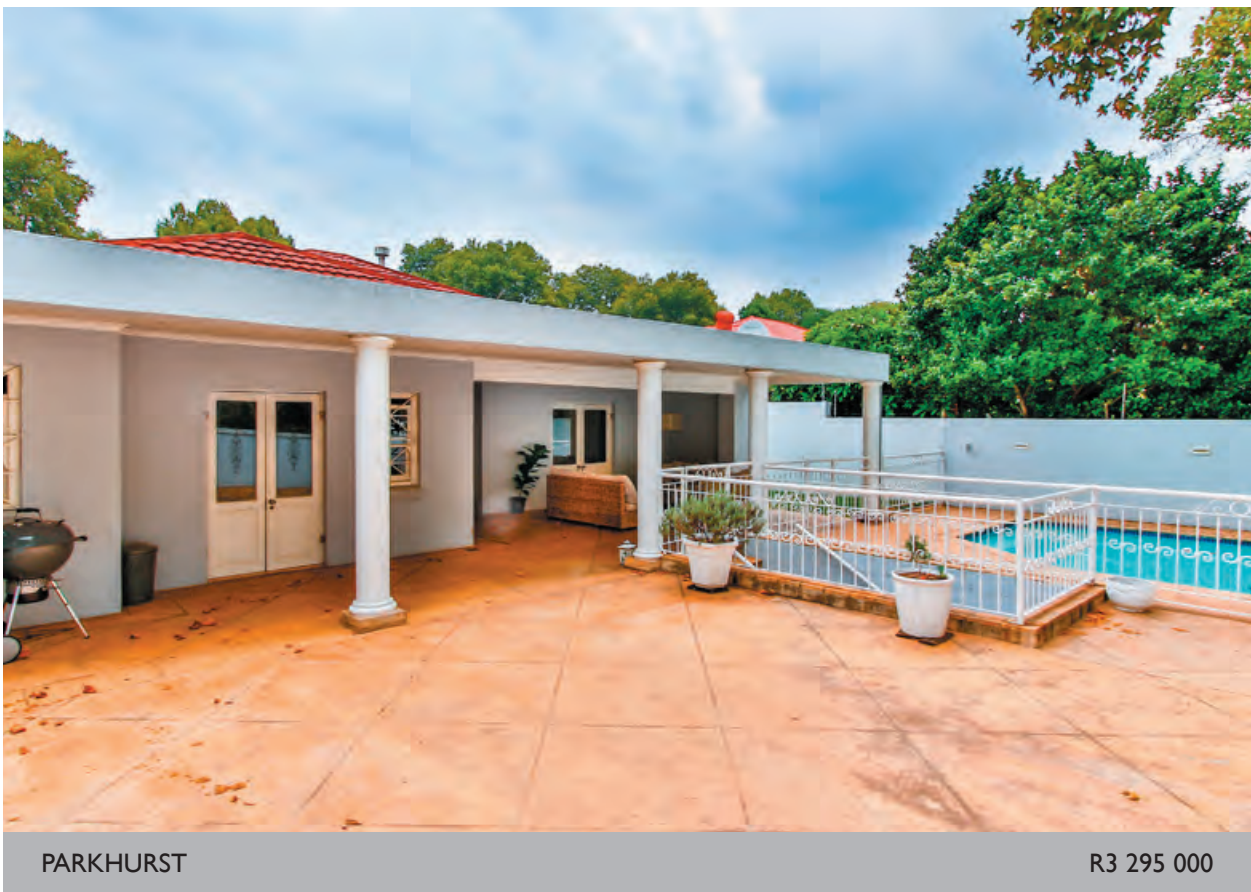
PARKHURST R3 295 000