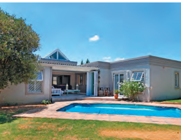
THE CREST R2 790 000