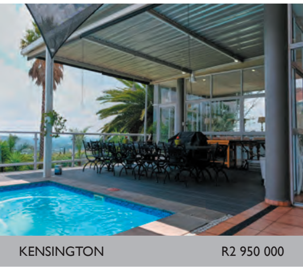
KENSINGTON R2 950 000

Local expertise, national presence and international audience