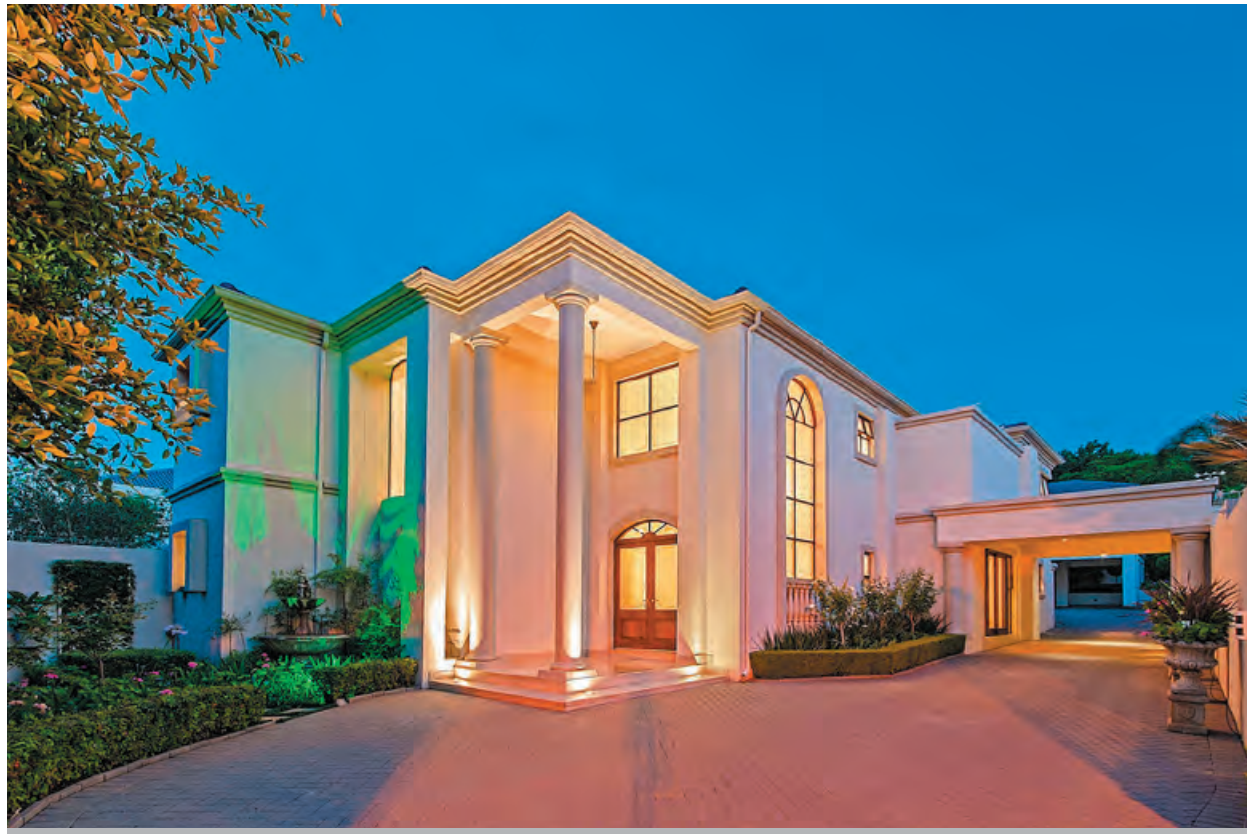
BRYANSTON R7 900 000

This immaculate double-storey cluster is set on a large stand of ± 1260sqm in an established manicured garden together with a tea room gazebo. This unique property, with its upmarket features is for those that like modern and trendy, yet private and functional. With plenty of space to entertain this 4 bedroom master built property is a must see. 24-Hour security, surround sound and underfloor heating welcome you home.