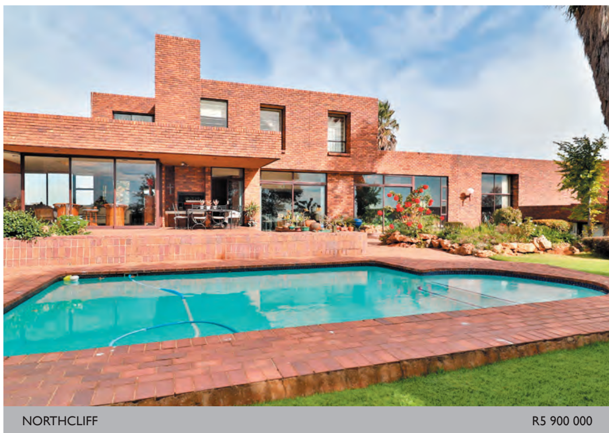
NORTHCLIFF R5 900 000