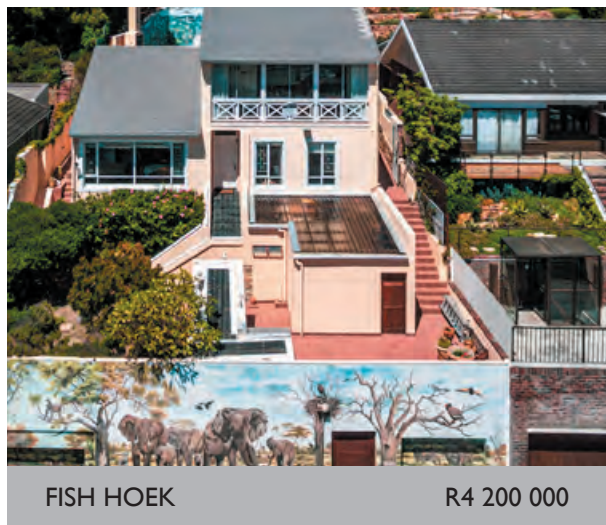
FISH HOEK R4 200 000