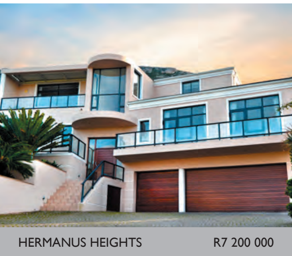
HERMANUS HEIGHTS R7 200 000

Local expertise, national presence and international audience