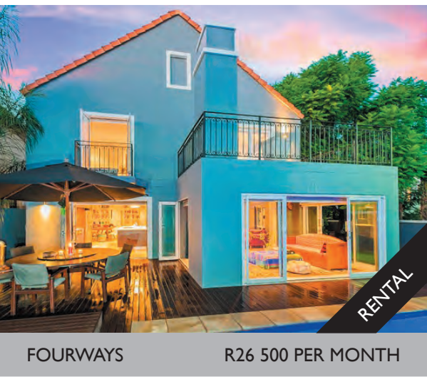
FOURWAYS R26 500 PER MONTH

Local expertise, national presence and international audience