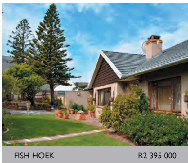
FISH HOEK R2 395 000