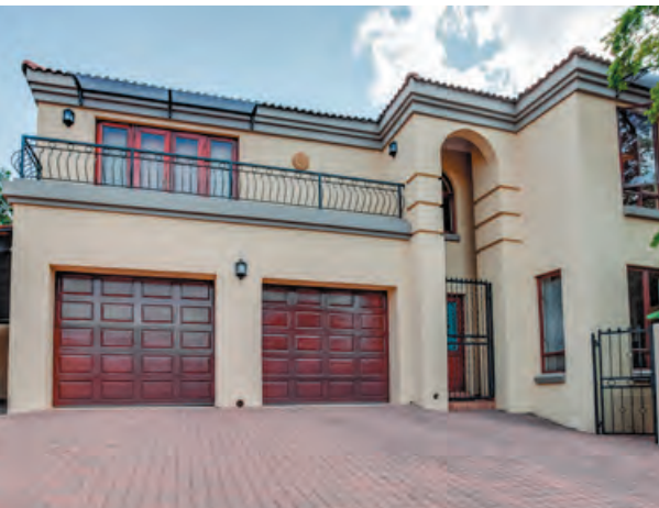
BRYANSTON R3 400 000

Local expertise, national presence and international audience