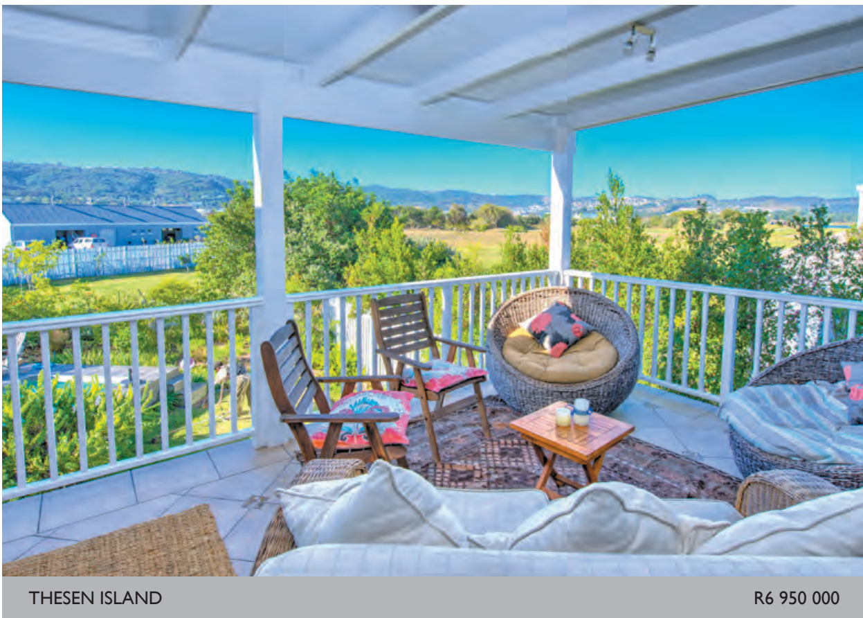
THESEN ISLAND R6 950 000