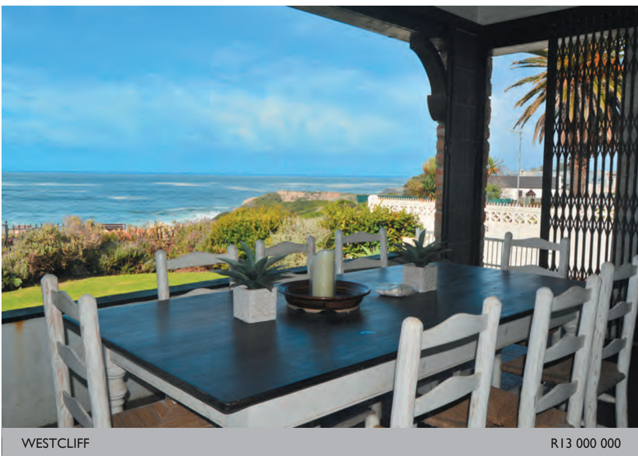
WESTCLIFF R13 000 000