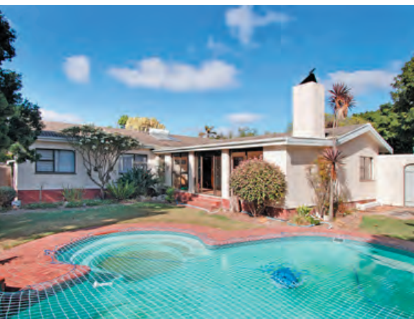
EVERSDAL HEIGHTS R3 670 000

Local expertise, national presence and international audience