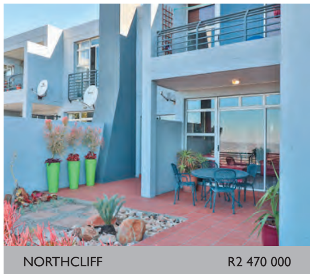
NORTHCLIFF R2 470 000