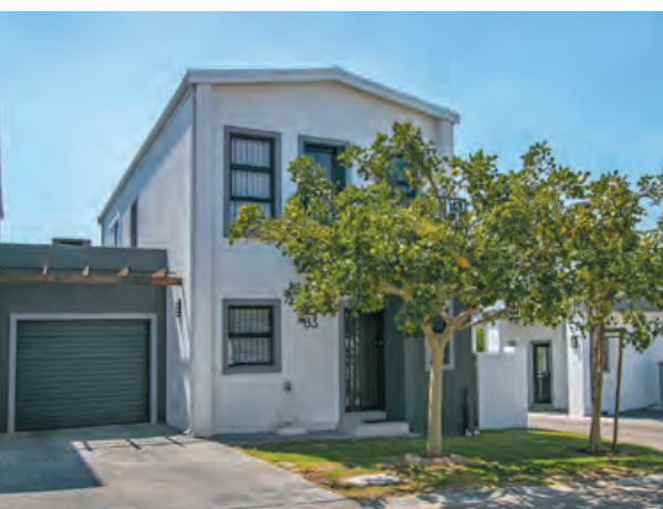
TANGLEWOOD ESTATE R2 195 000