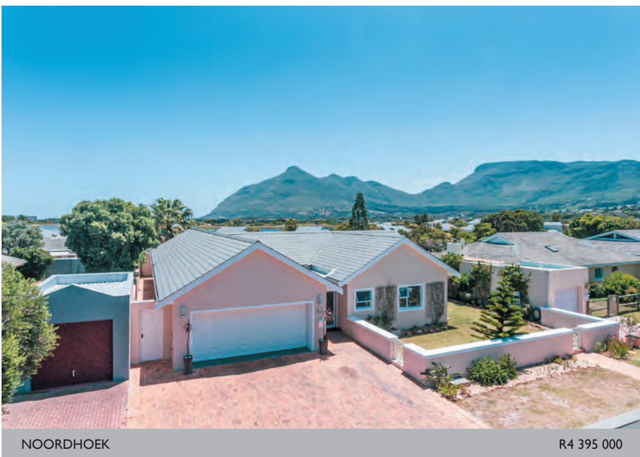
NOORDHOEK R4 395 000