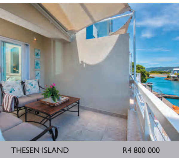
THESEN ISLAND R4 800 000