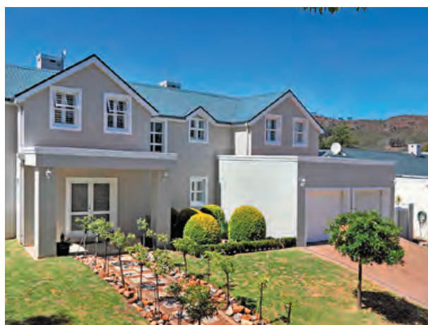
FRANSCHHOEK R5 950 000