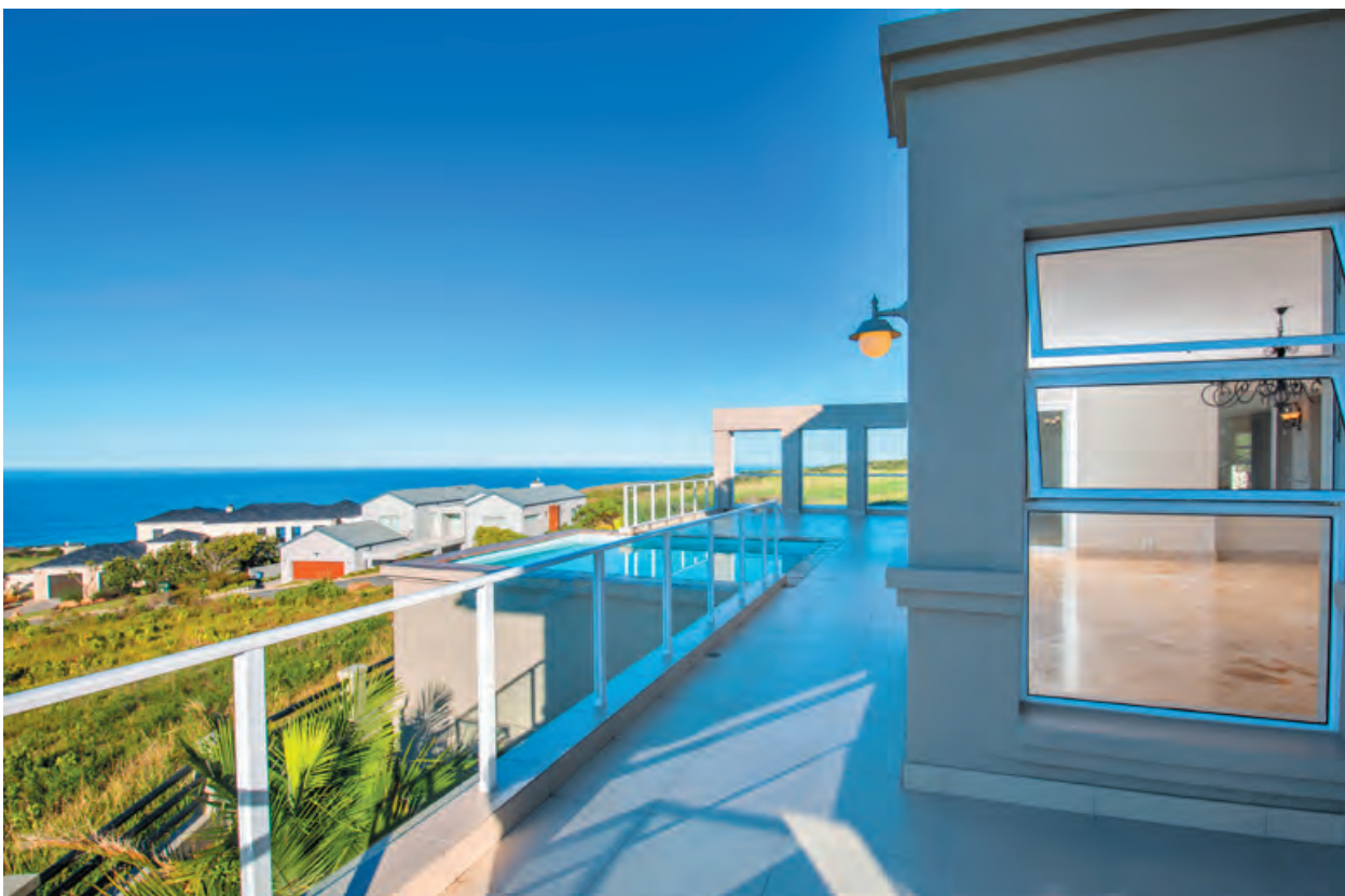
PEZULA GOLF ESTATE R14 950 000