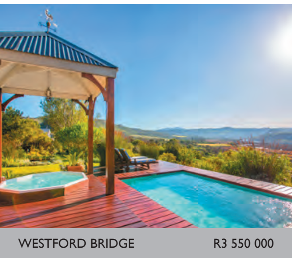
WESTFORD BRIDGE R3 550 000