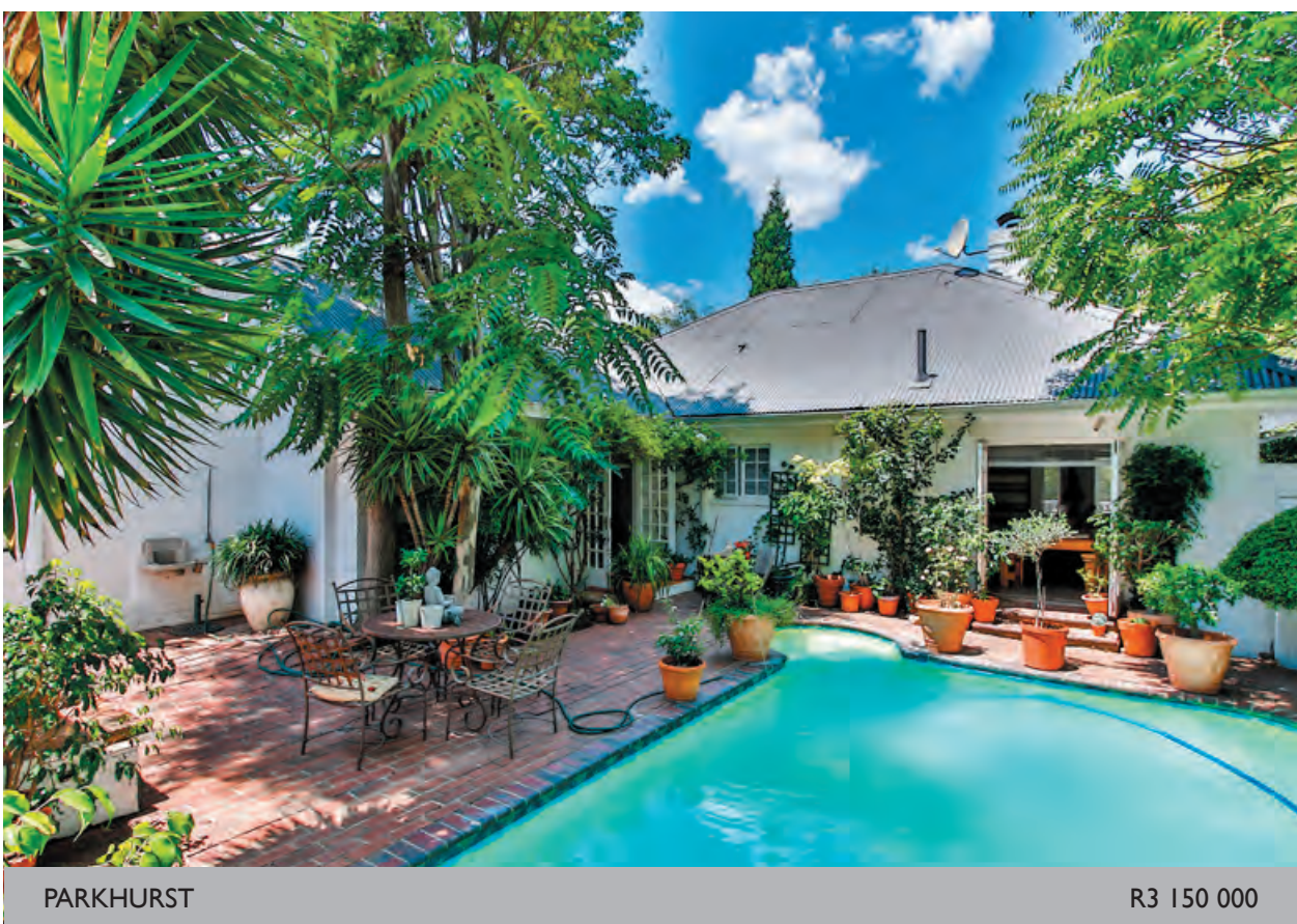
PARKHURST R3 150 000