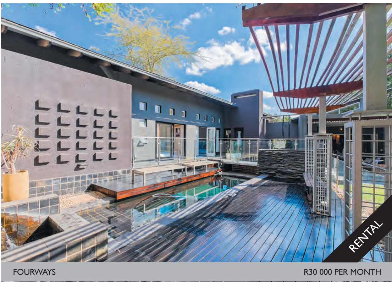
FOURWAYS R30 000 PER MONTH

Chase Reynolds 081 574 8845 WEB: 1628463