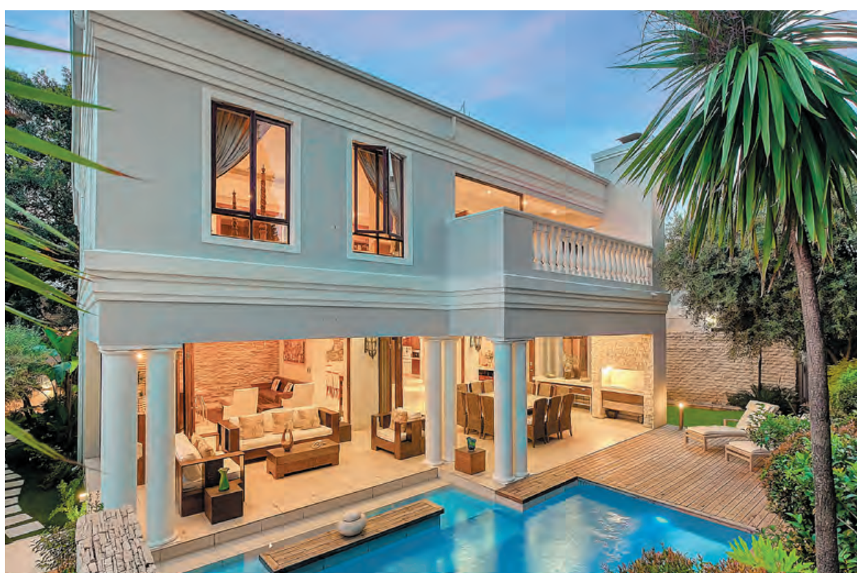
ATHOLL R10 500 000