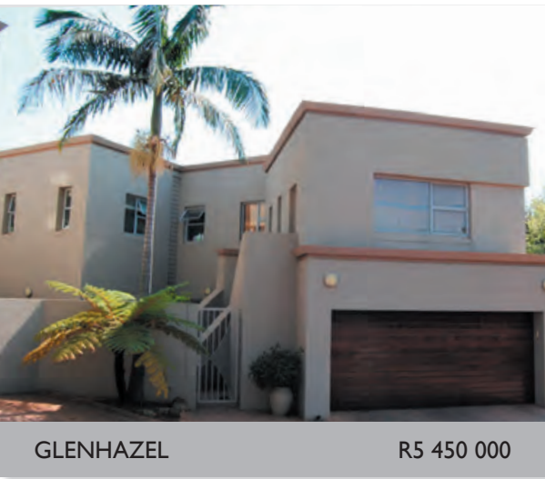
GLENHAZEL R5 450 000