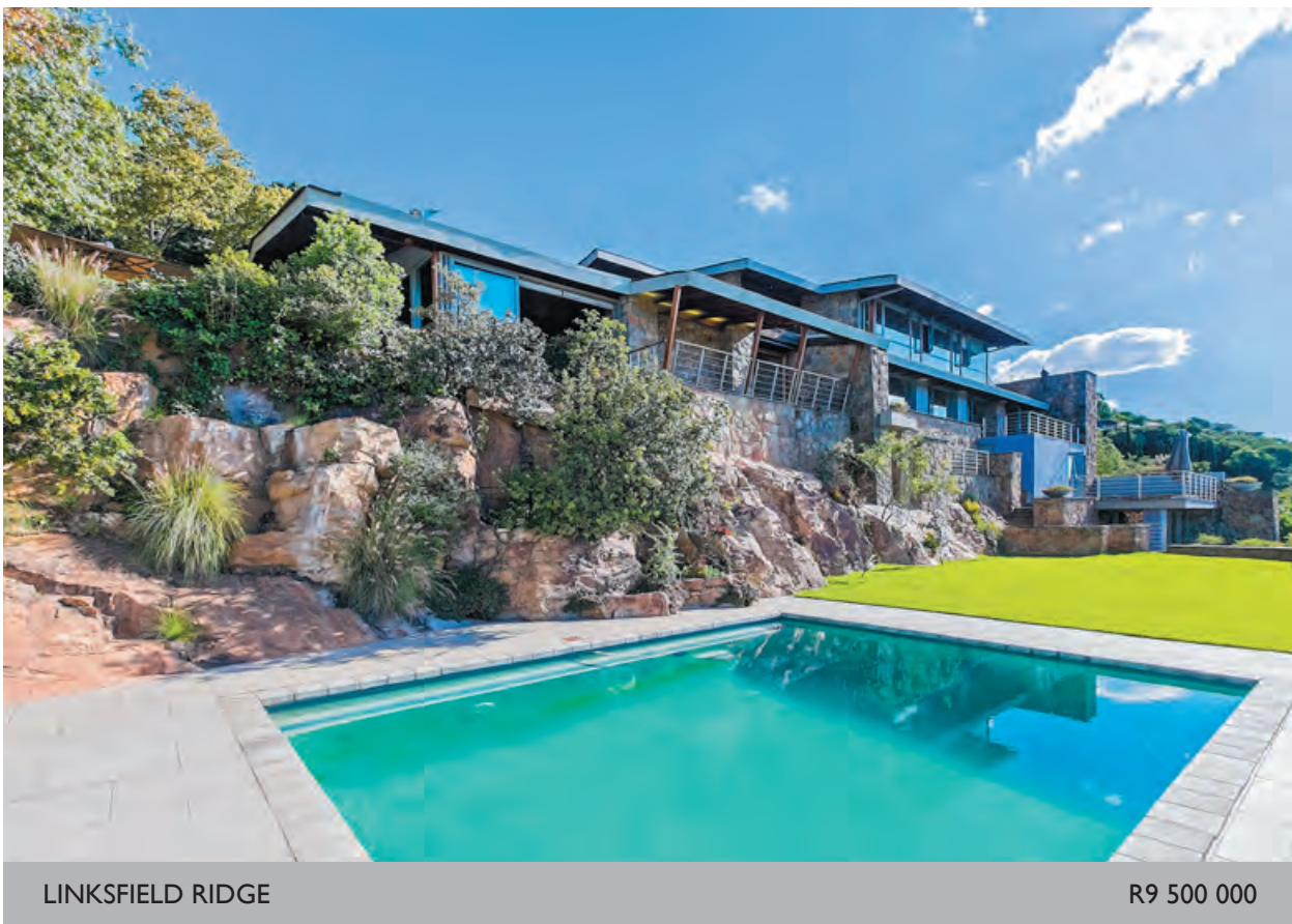
LINKSFIELD RIDGE R9 500 000