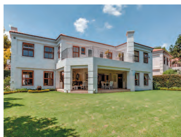
BRYANSTON R5 600 000