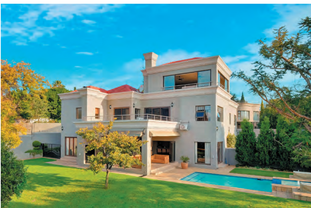
BRYANSTON R7 950 000