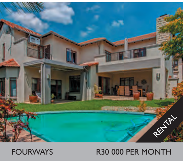
FOURWAYS R30 000 PER MONTH

Positioned in the hidden gem being Hawthorne Village Estate, is this bold contemporary home. This well-proportioned home offers light-filled living spaces and provides a spacious and private family environment.