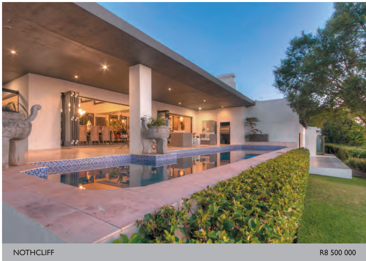
NOTHCLIFF R8 500 000