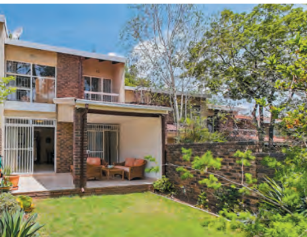
BRYANSTON R1 999 000