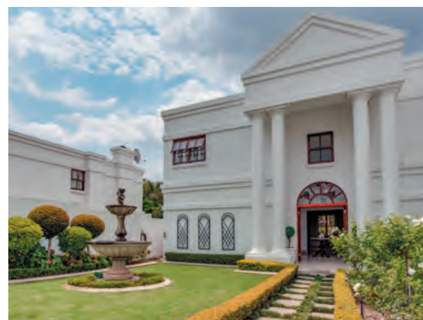
BRYANSTON R4 950 000

This well-kept 4 bed, 3 bath home in a sought-after secure estate could be yours. Offering open-plan living areas with formal and family lounges, dining room and modern kitchen with separate scullery and laundry.