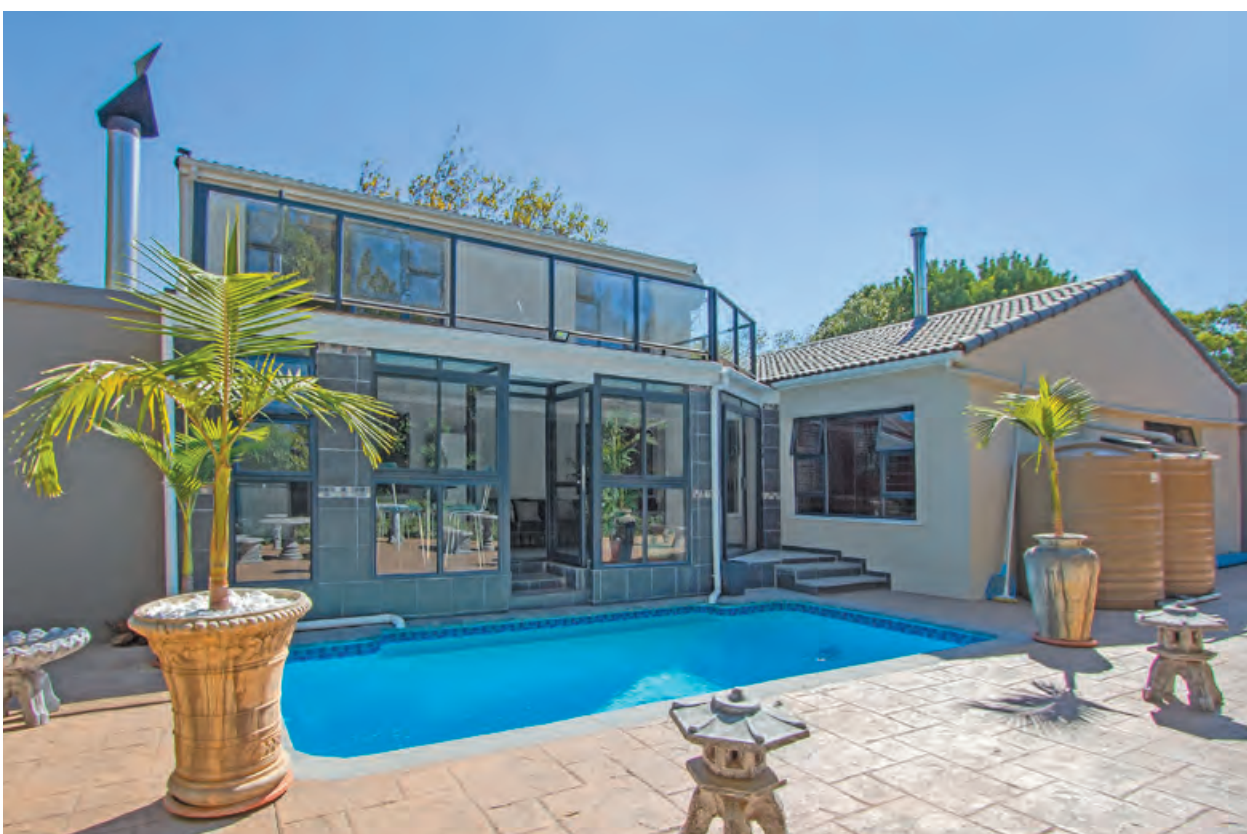
DURBANVILLE HILLS R3 899 000