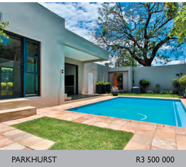
PARKHURST R3 500 000