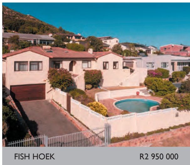
FISH HOEK R2 950 000