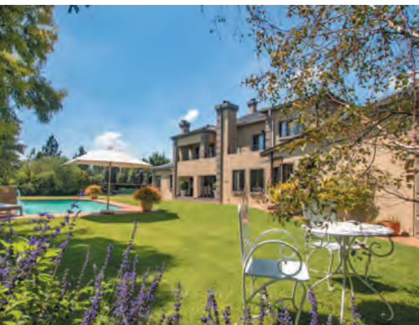
SUMMERSET ESTATE R4 600 000

Local expertise, national presence and international audience