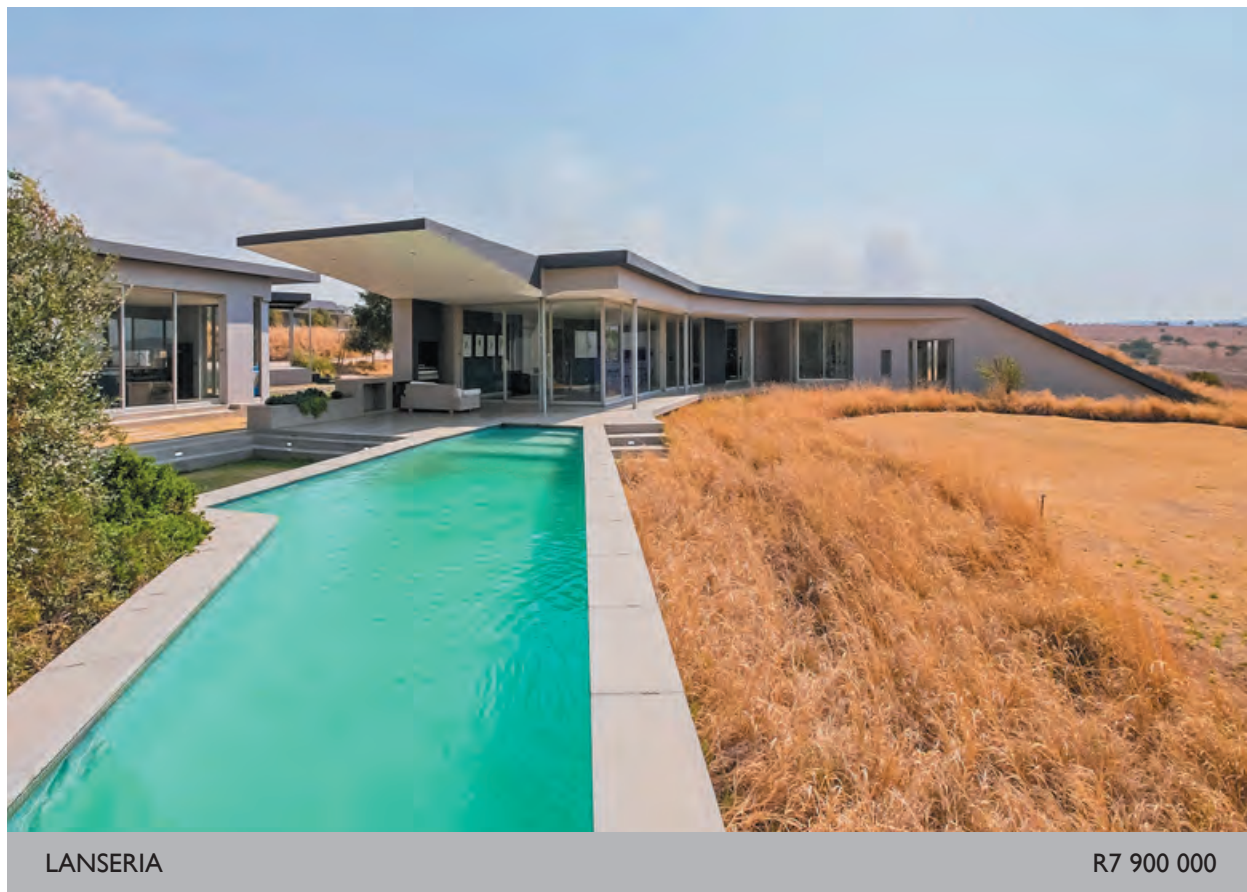
LANSERIA R7 900 000