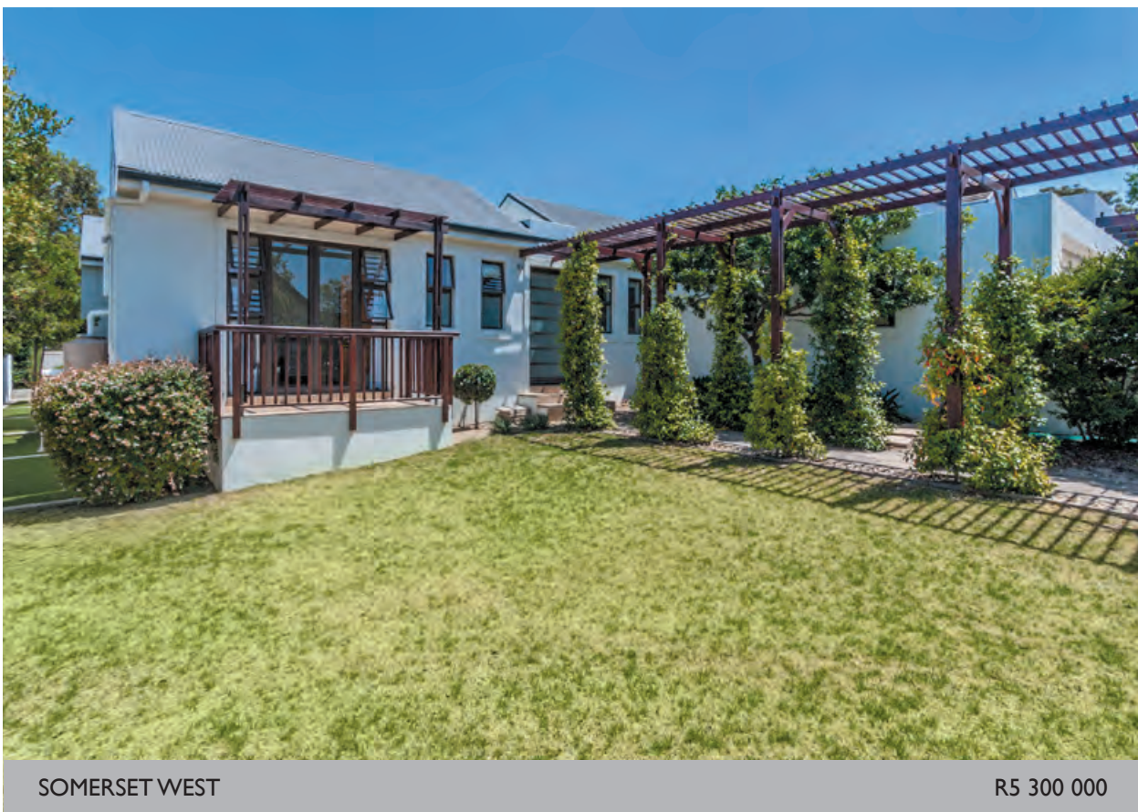
SOMERSET WEST R5 300 000