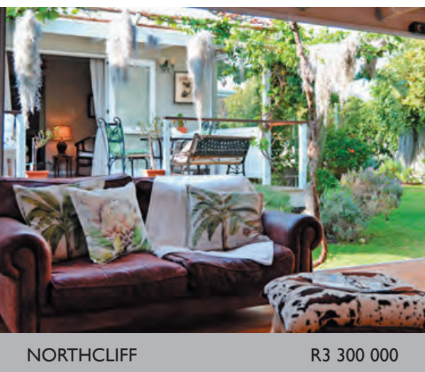
NORTHCLIFF R3 300 000