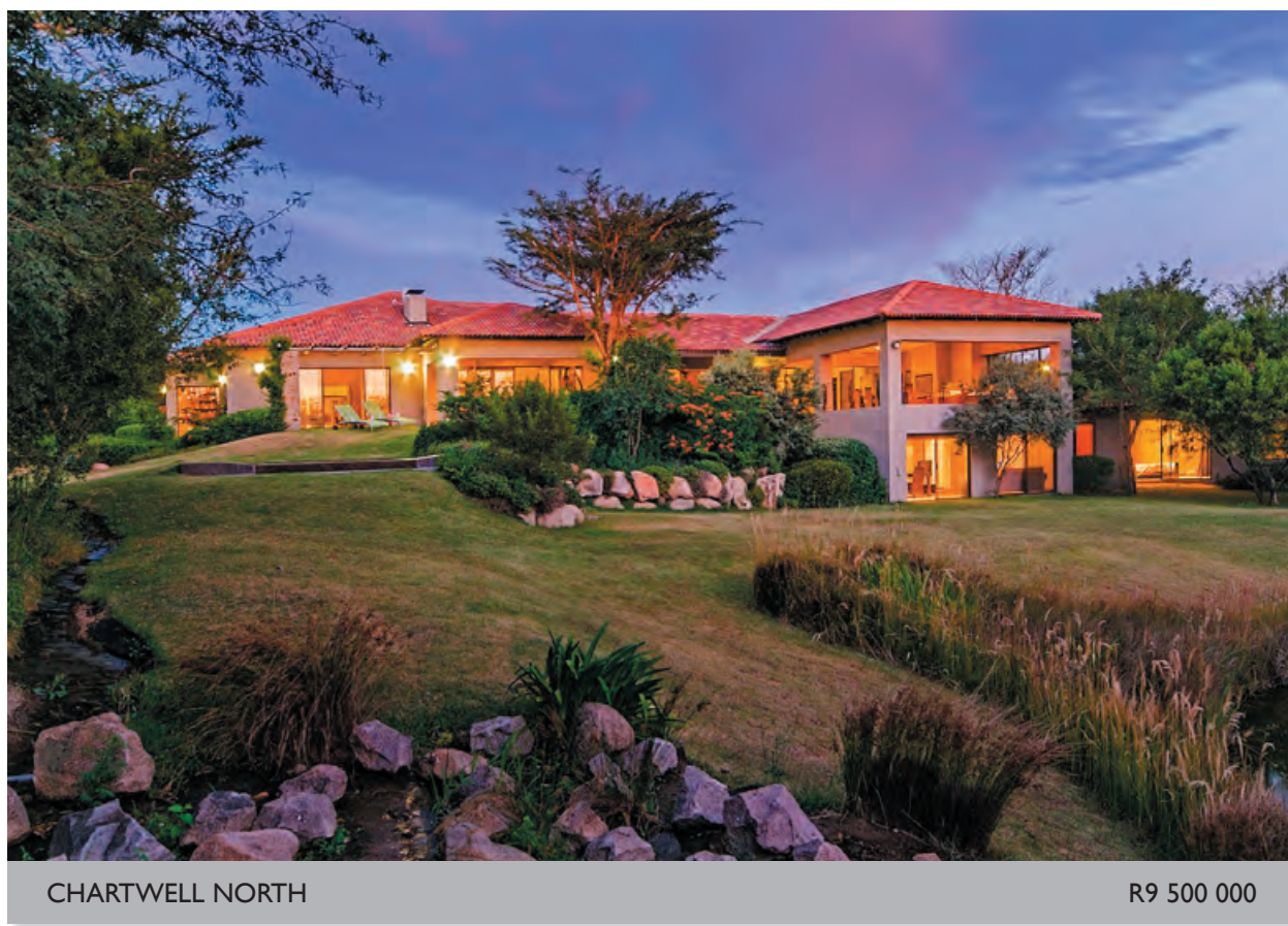
CHARTWELL NORTH R9 500 000

A truly unique opportunity to own your own hectare of bushveld in a wonderfully secure estate adjacent to Steyn City. Own one of the only 7 homes in prestigious Thuli Estate where the focus is on maintaining the natural indigenous landscape and encouraging birdlife. The home offers elegant carefree living. Enjoy exquisite sunsets whilst relaxing on the verandah overlooking your own private dam and indigenous flora prolific with birdlife.