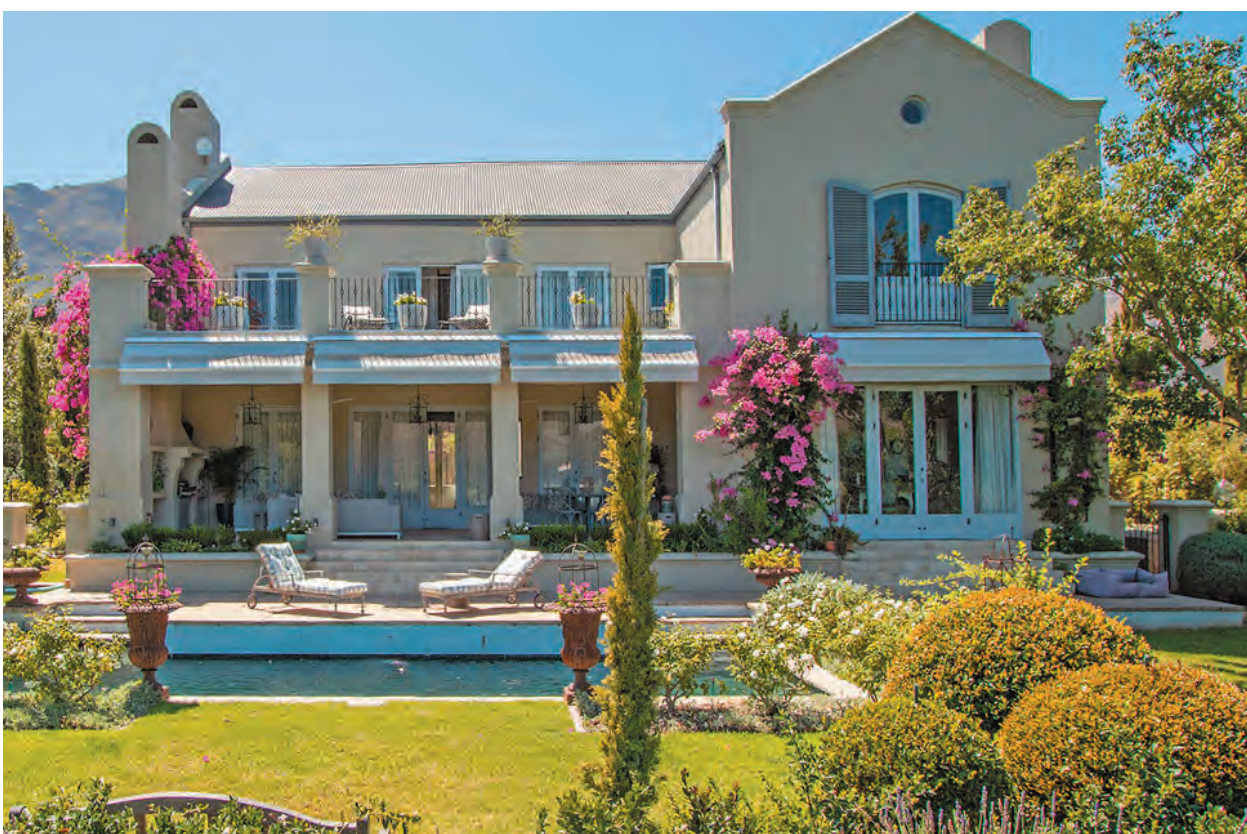
FRANSCHHOEK R15 950 000