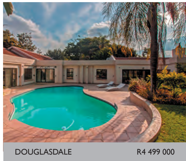
DOUGLASDALE R4 499 000