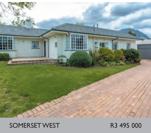
SOMERSET WEST R3 495 000