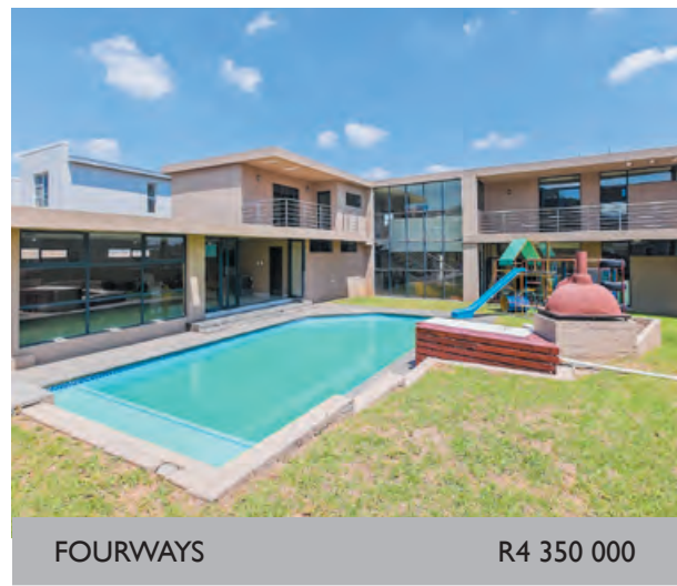
FOURWAYS R4 350 000

The property exudes style and is located on an elevated block within the trendy Cedar Creek Estate. It offers stunning views. This home is an entertainer's dream and comes with amazing features.