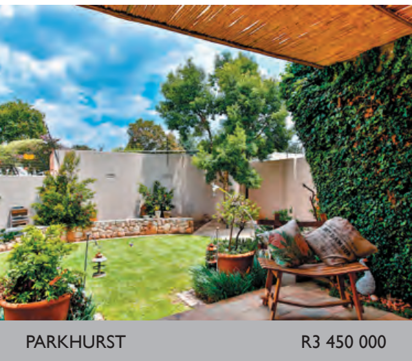
PARKHURST R3 450 000

Local expertise, national presence and international audience