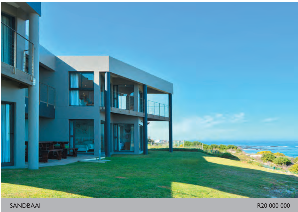
SANDBAAI R20 000 000