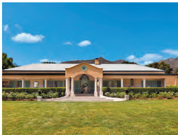
FRANSCHHOEK R38 500 000