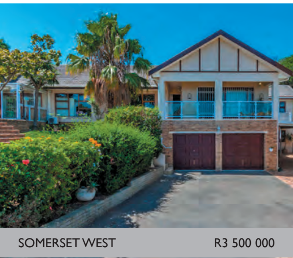
SOMERSET WEST R3 500 000

Local expertise, national presence and international audience