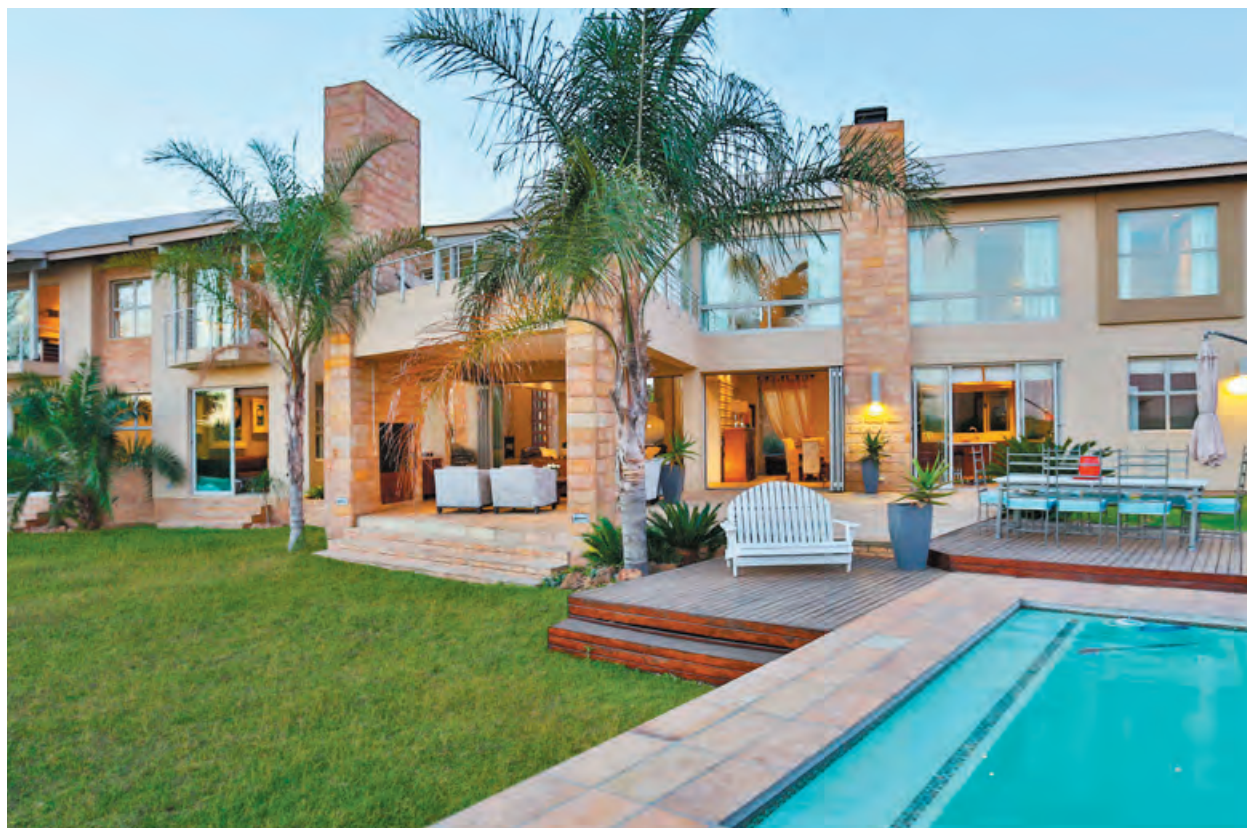
SADDLEBROOK ESTATE R8 900 000