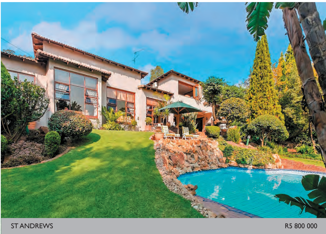
ST ANDREWS R5 800 000