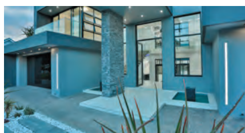
Cover property 07

DESIGN & LAYOUT FINE & COUNTRY STUDIO Lesley Saunders studio.sandton@fineandcountry.co.za