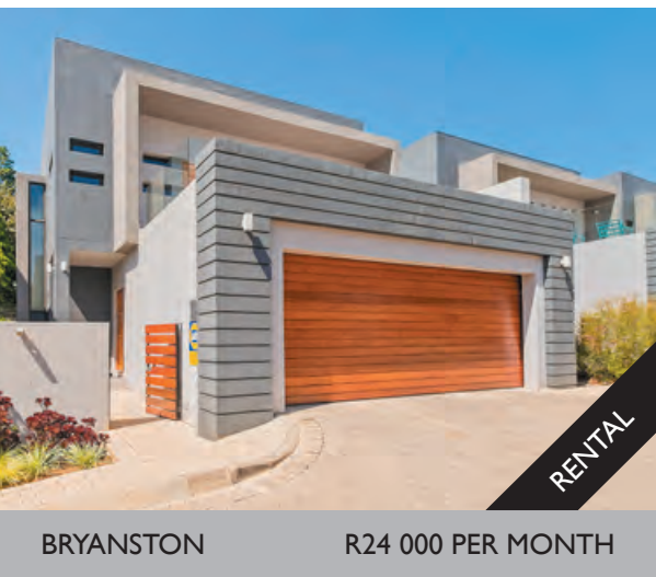
BRYANSTON R24 000 PER MONTH

Chase Reynolds 081 574 8845 WEB: 1693674