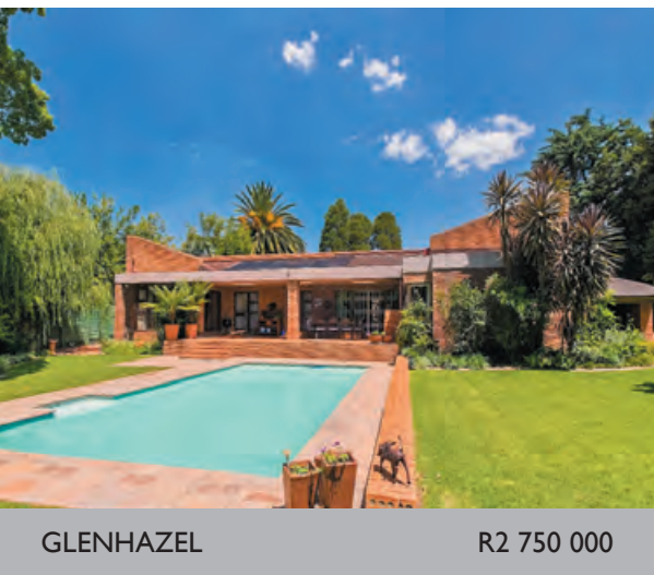
GLENHAZEL R2 750 000