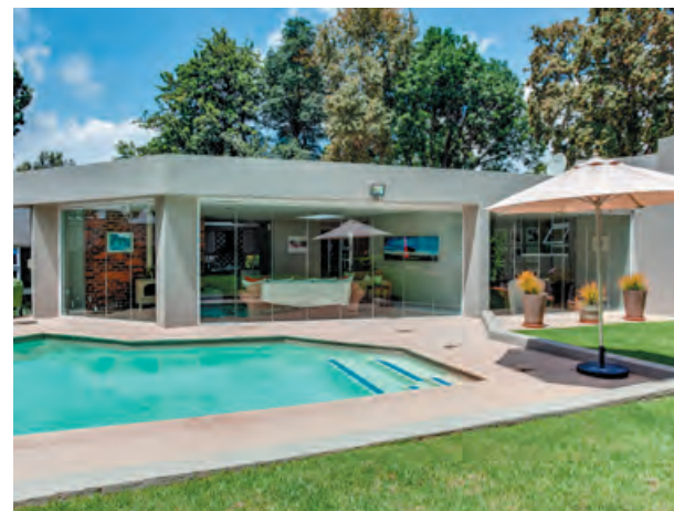
BRYANSTON R4 999 000

Outstanding home with 3 en-suite bedrooms and a separate en-suite guest cottage, all set on a spacious ± 2000sqm stand. Stunning open-plan living areas and modern kitchen. Excellent security. Load shedding proof.