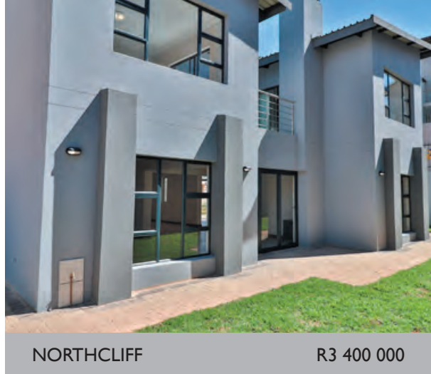
NORTHCLIFF R3 400 000