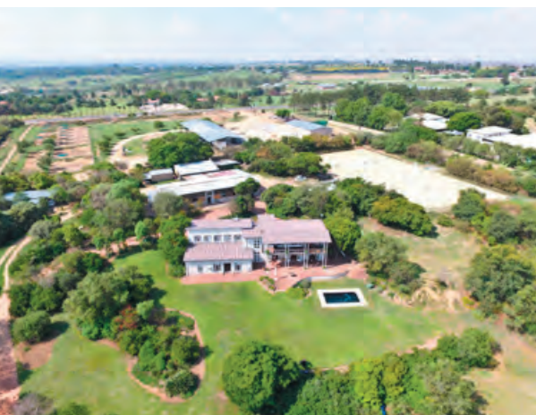
BRIDLE PASS AH R10 499 000