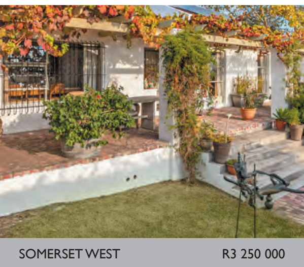
SOMERSET WEST R3 250 000